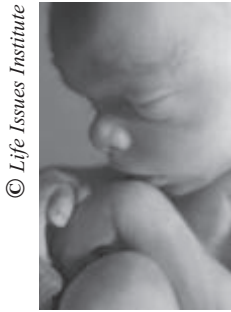
20 weeks from conception

Regions Hospital Closes Abortion Center! - p. 1 and 2 Babies Saved at New PP Mega-Mill in St. Paul - p. 1 40 Days for Life in Orlando and St. Paul - p. 3 & insert